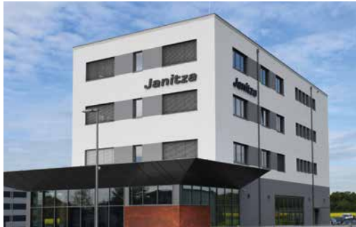
Headquarters: Lahnau, Germany.

The extensive Janitza product portfolio ranges from transformers to measuring devices, from communications equipment to the IT environment, to software solutions and data analyses.